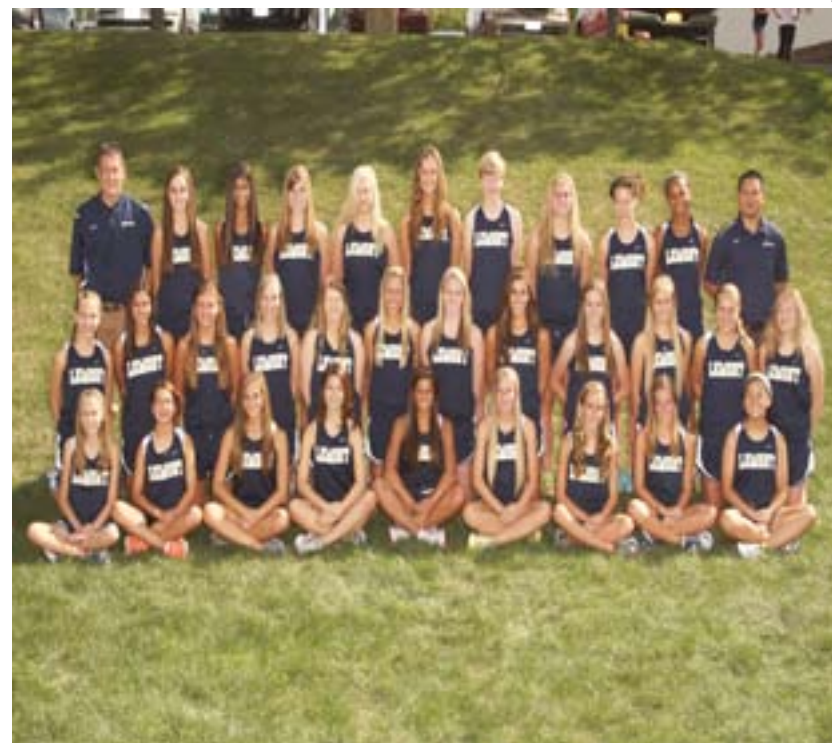
Girls Cross Country Team 2012

The teams have five more meets before beginning their road to state with regionals on Oct. 20, including a home meet on Oct. 2 at Mount Assisi Academy. This will be their only home meet this year; a good time to come out and support our cross country athletes.