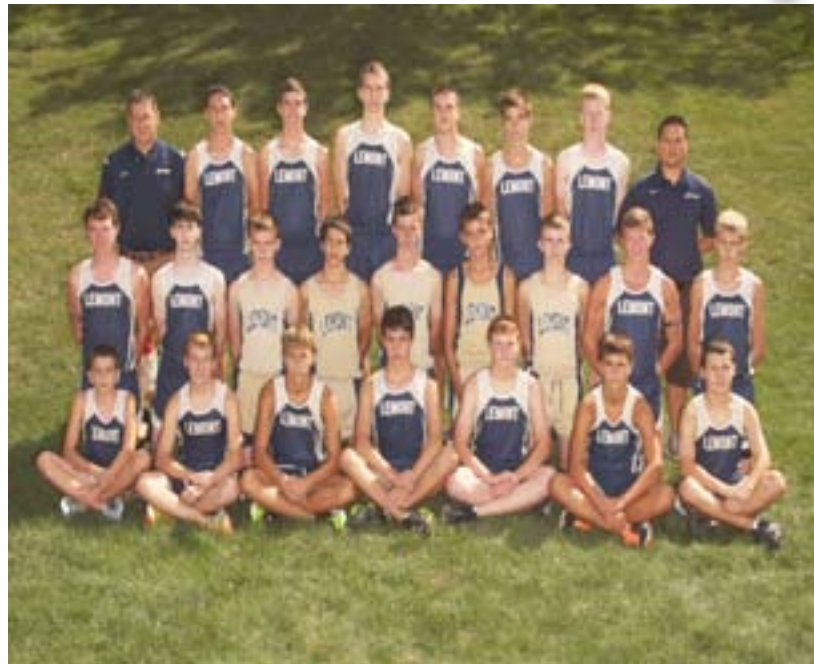
Boys Cross Country Team 2012