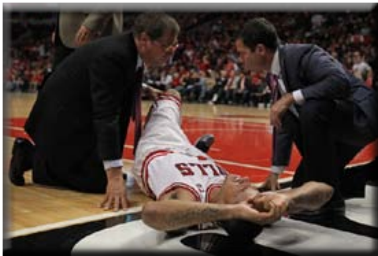
Former MVP Derrick Rose tears ACL in the Bulls' first playoff game last season.

Then they will count on Rose to once again rise above and get them over the top.