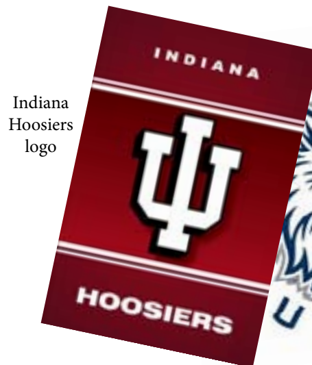
Indiana Hoosiers logo

With the season just around the corner, teams have their eyes set on the National Championship.